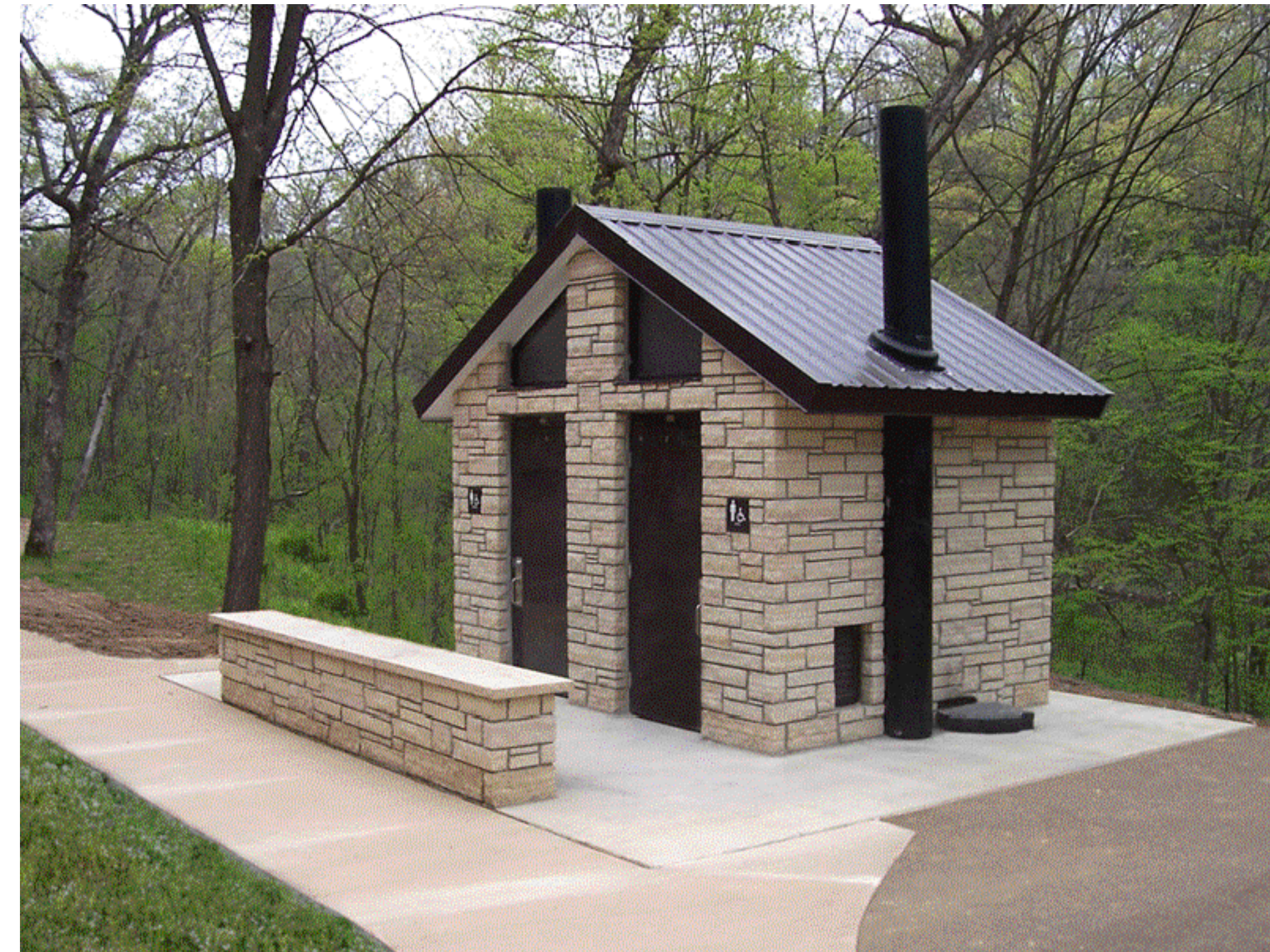
4 Proposed Waterless Restrooms NTS